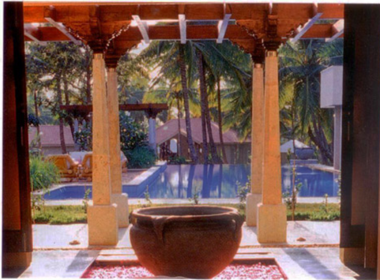
A calming view: The retreat is ideal for the over-worked jet-setters of Bengaluru

Shreyas has recently made it to the 2011 Relais & Châteaux Guide, and is a part of the exclusive, handpicked club of 500 properties from across the globe. And that is because it is one of the best places to relax, recharge and rejuvenate your body as well as soul. ■