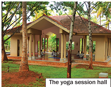
The yoga session hall