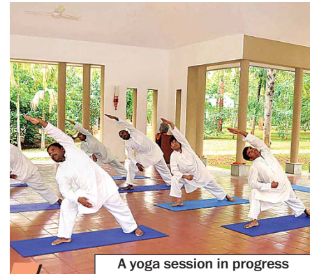
A yoga session in progress