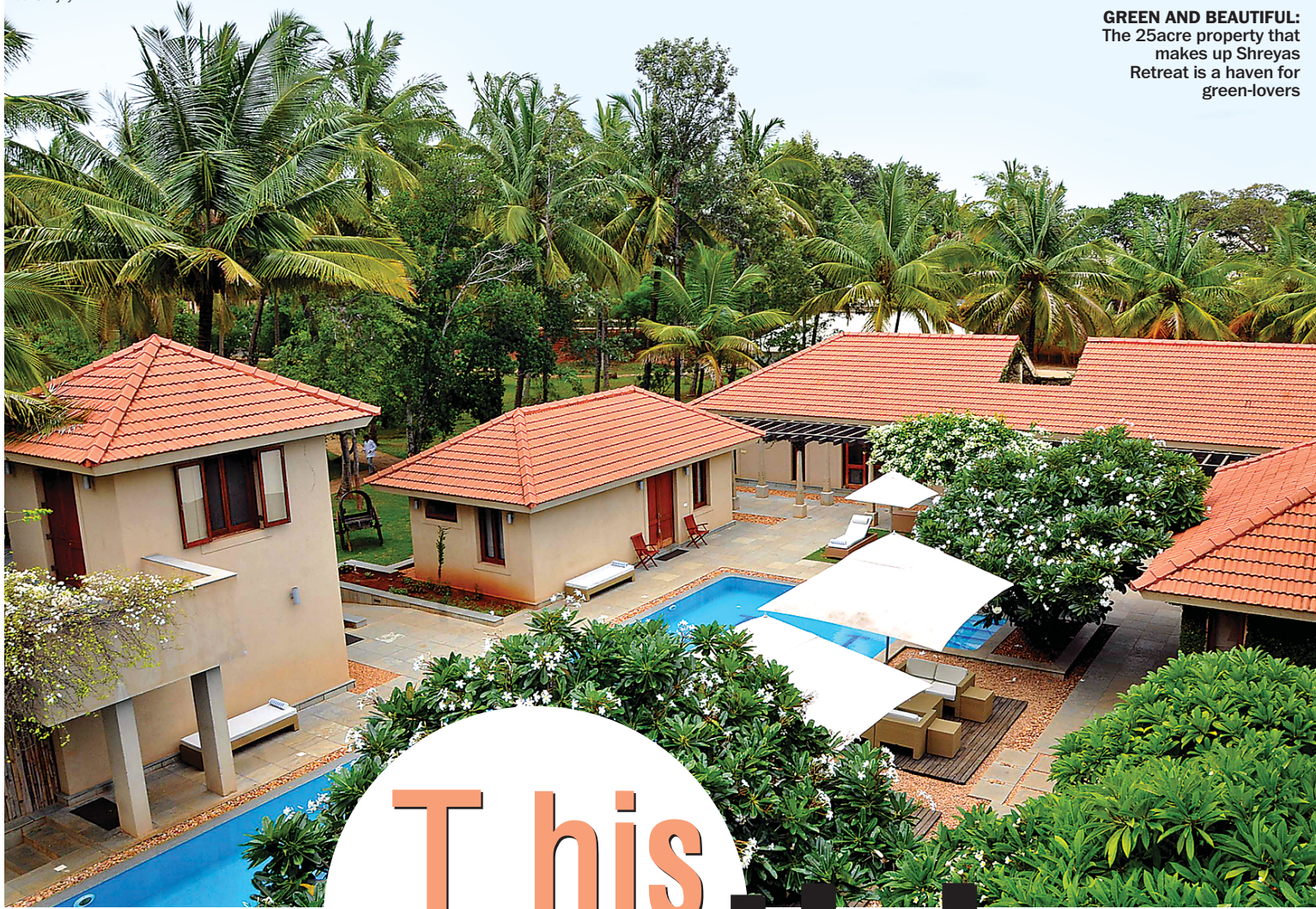
GREEN AND BEAUTIFUL: The 25-acre property that makes up Shreyas Retreat is a haven for green-lovers