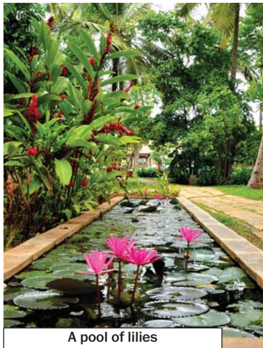
A pool of lilies

Straight out of a fantasy, this yoga and health resort tucked away on the outskirts of Nelamangala, 45km away from Bangalore — Shreyas Retreat is the perfect destination for that wholesome relaxation getaway — for the mind, the soul and the body