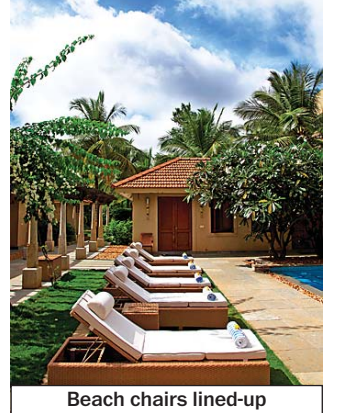
Beach chairs lined-up