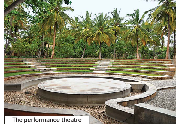
The performance theatre