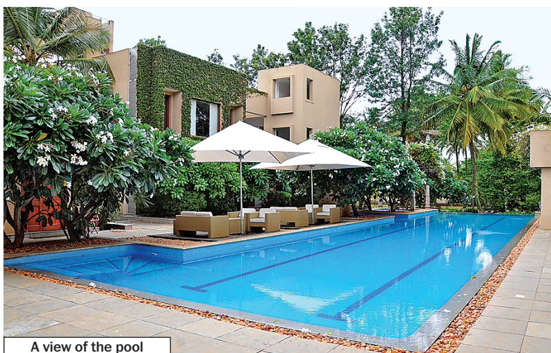
A view of the pool

Day two began with a walk in the sprawling gardens on one end of the property, followed by a breakfast served in one of the many thatched tree-houses located conveniently across the property. Sit back, relax on the mattresses and cushions, read a book or watch a train go by — this is the life. The breeze is constant in areas