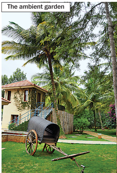
The ambient garden

We arrived at night and so after a scrumptious dinner with a pure-vegetarian set-menu presented and cooked to perfection, we retired. The food was nourishing — home-grown vegetables, cooked in mild spices and oils paired with warm broths, crunchy salads and desserts that herald the finesse of healthy Indian cooking. This was culinary heaven.