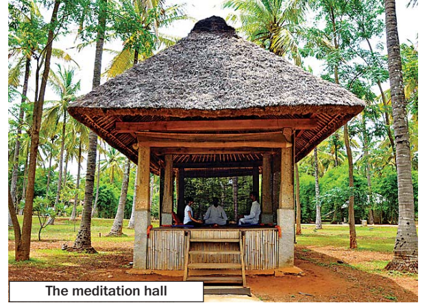
The meditation hall