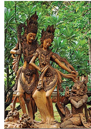
A scene from the Ramayana