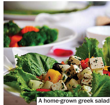
A home-grown greek salad

After a night of sound sleep, we woke up to loud bird-calls and a cool breeze-caressing the whole 25-acre property. Our room opened up into the all-weather infinity pool with four rooms around it. The glistening clear water was tempting, but had to be painfully